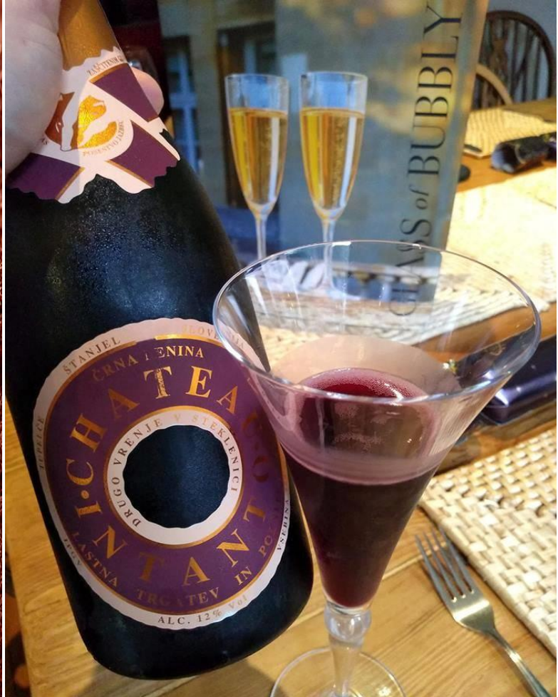
World No.1 Sparkling Red Wine Chateau Intanto. ( Top 5 and Trophy – Forget me Not, London 2018, Champion New York 2019)