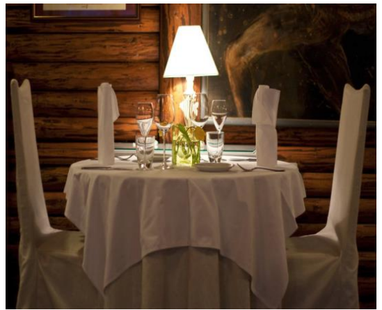
Pikol The Most Famous SLO Fish Restaurant ( Slow Food Specialist, No.1 plate 2018 in North Italy, Slovenia and Austria).