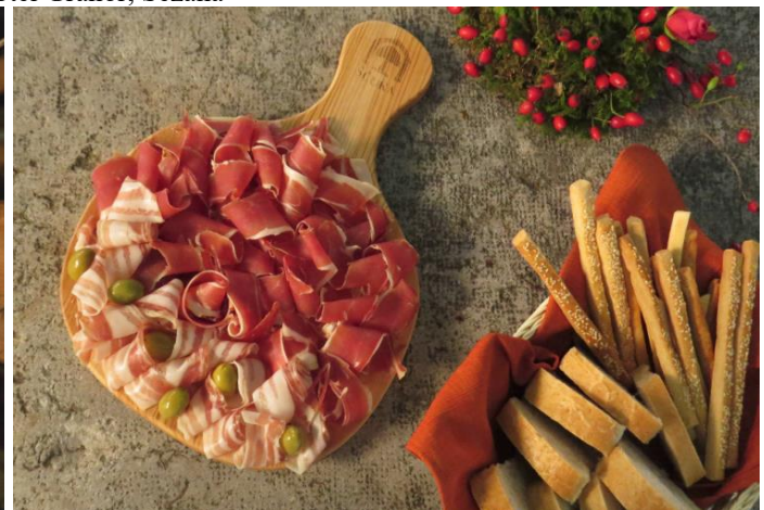
Kobjeglava Prosciutto Production Plant, seeing 10.000 dry hams in process and taking a Lunch in Kobjeglava Restaurant.