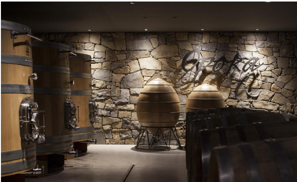
Marijan Simčič Winery