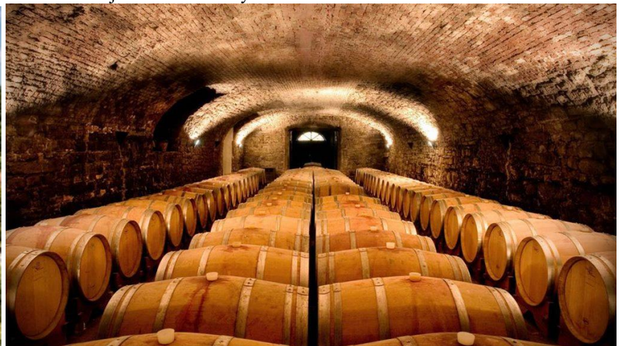
Goriška Brda Winery