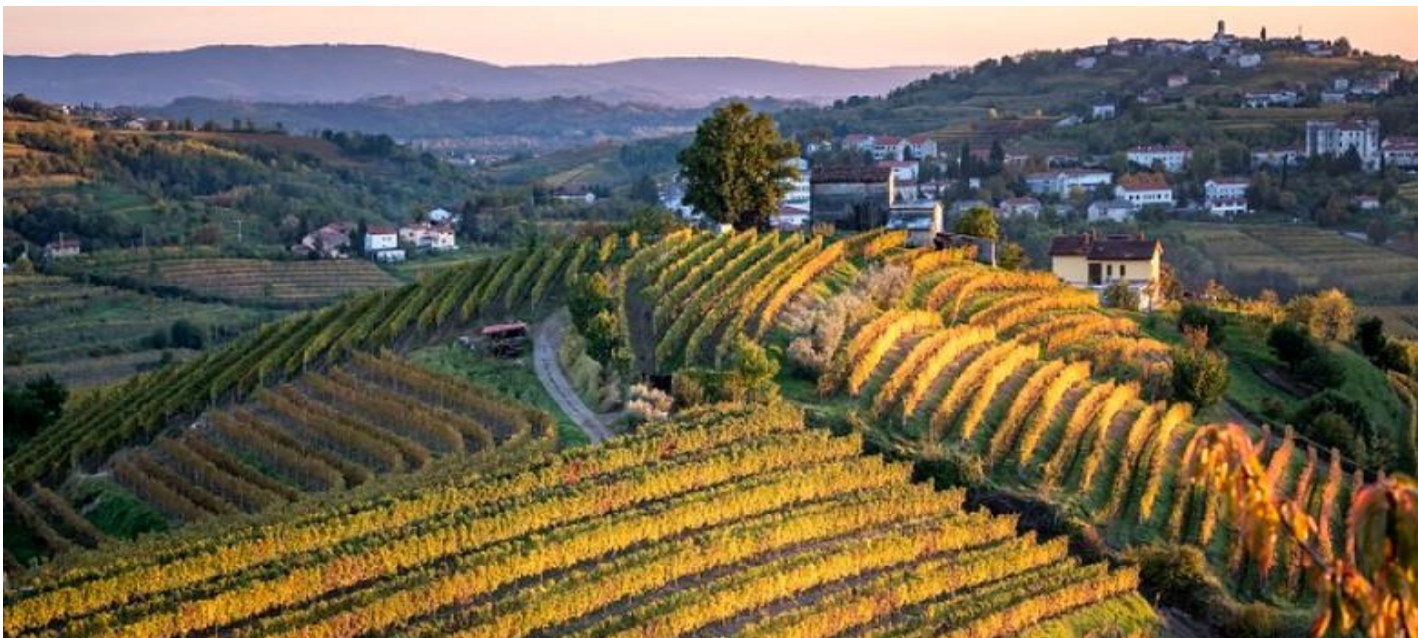
Goriška Brda / Collio – Slovenian Tuscany