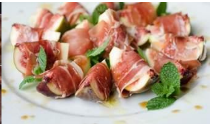
The Land of Prosciutto and Terra Rossa – The Carst Region