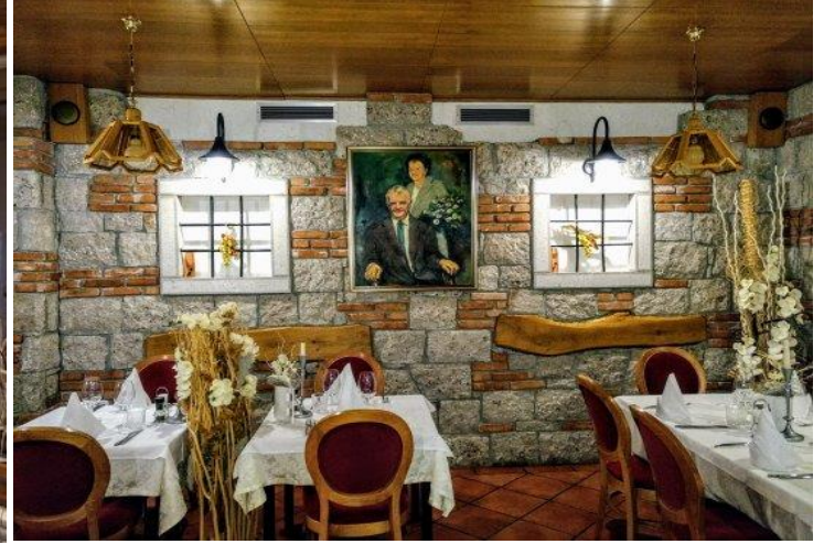
Hotel Grahor, Restaurant, Sežana