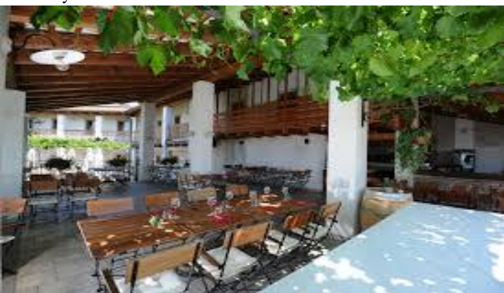
Best accommodation – in Goriška Brda - Belica Hotel / Restaurant