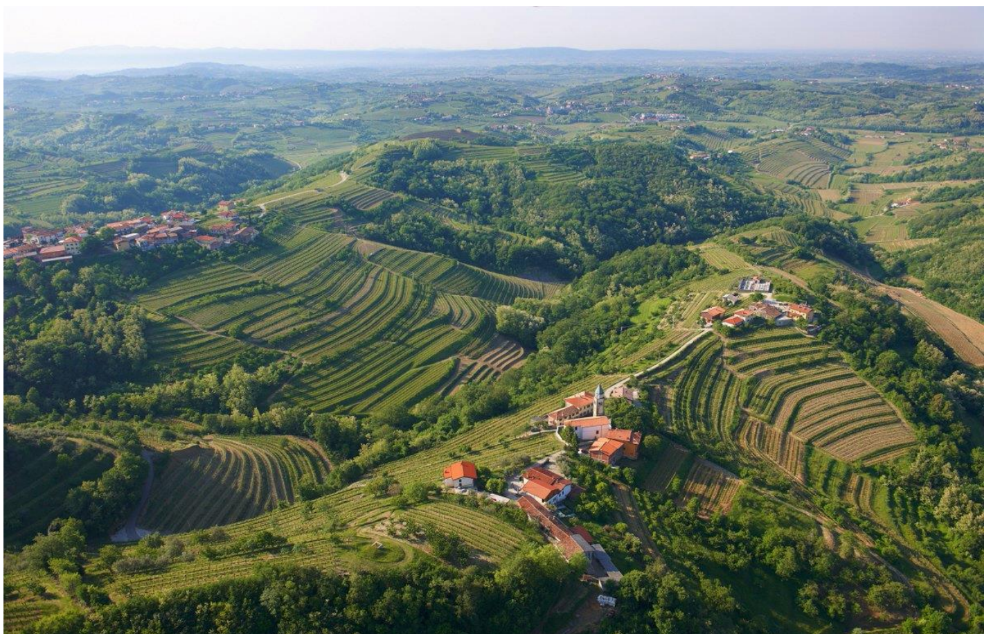
Goriška Brda / Collio – Slovenian Tuscany