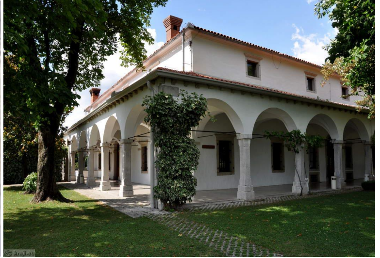
Castel of Zemono, Michelin star Restaurant, Vipava Valley