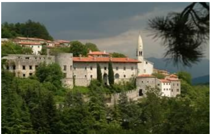
Štanjel The Hart of Carst and Terra Rossa