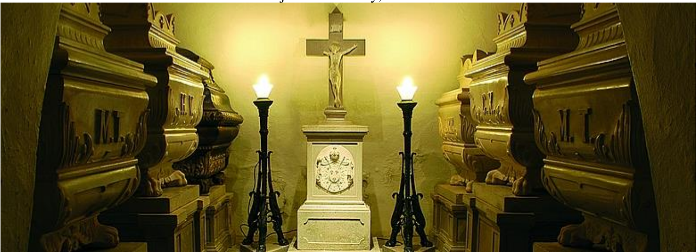
The Tombs of Last French Bourbon Imperors in Kostanjevica