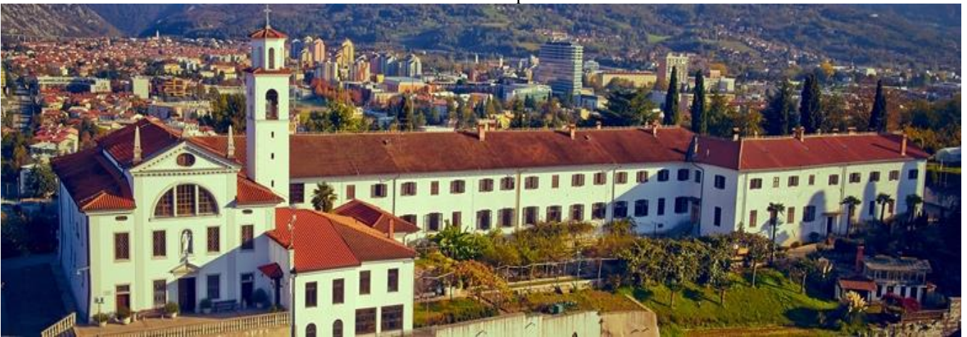
Kostanjevica Monastery, Nova Gorica