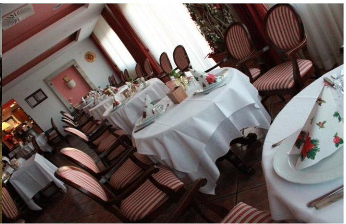
Hotel Grahor, Sežana