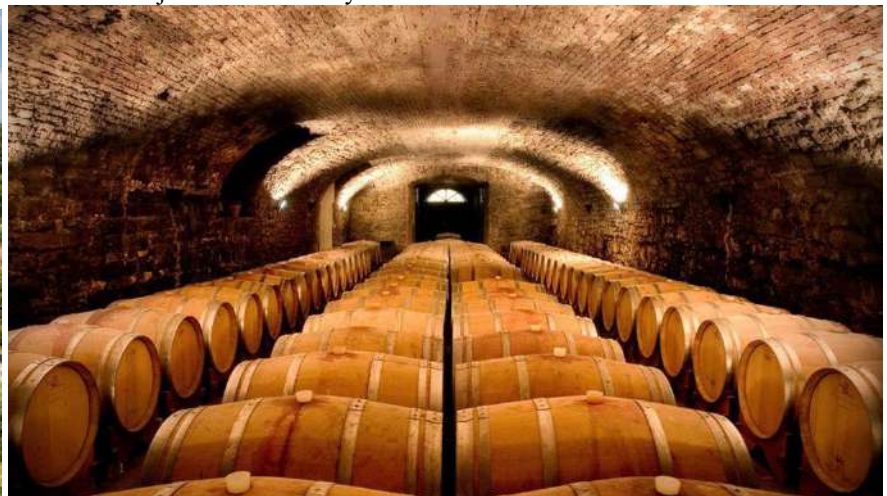
Goriška Brda Winery