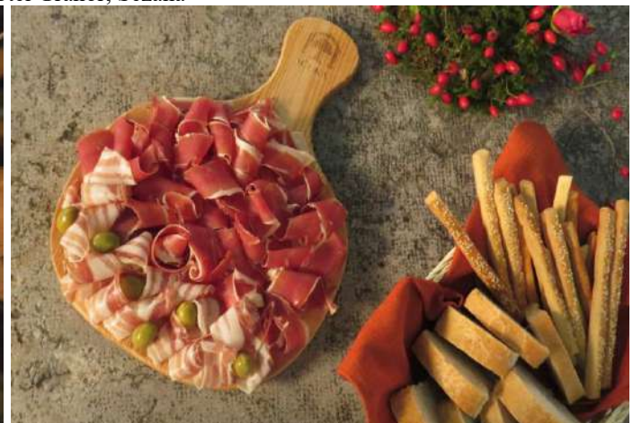
Kobjeglava Porsciuto Production Plant, seeing 10.000 dry hams in process and taking a Lunch in Kobjeglava Restaurant.