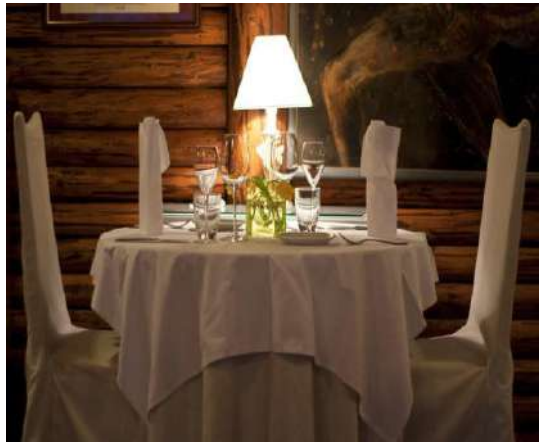
Pikol The Most Famous SLO Fish Restaurant ( Slow Food Specialist, No.1 plate 2018 in North Italy, Slovenia and Austria).