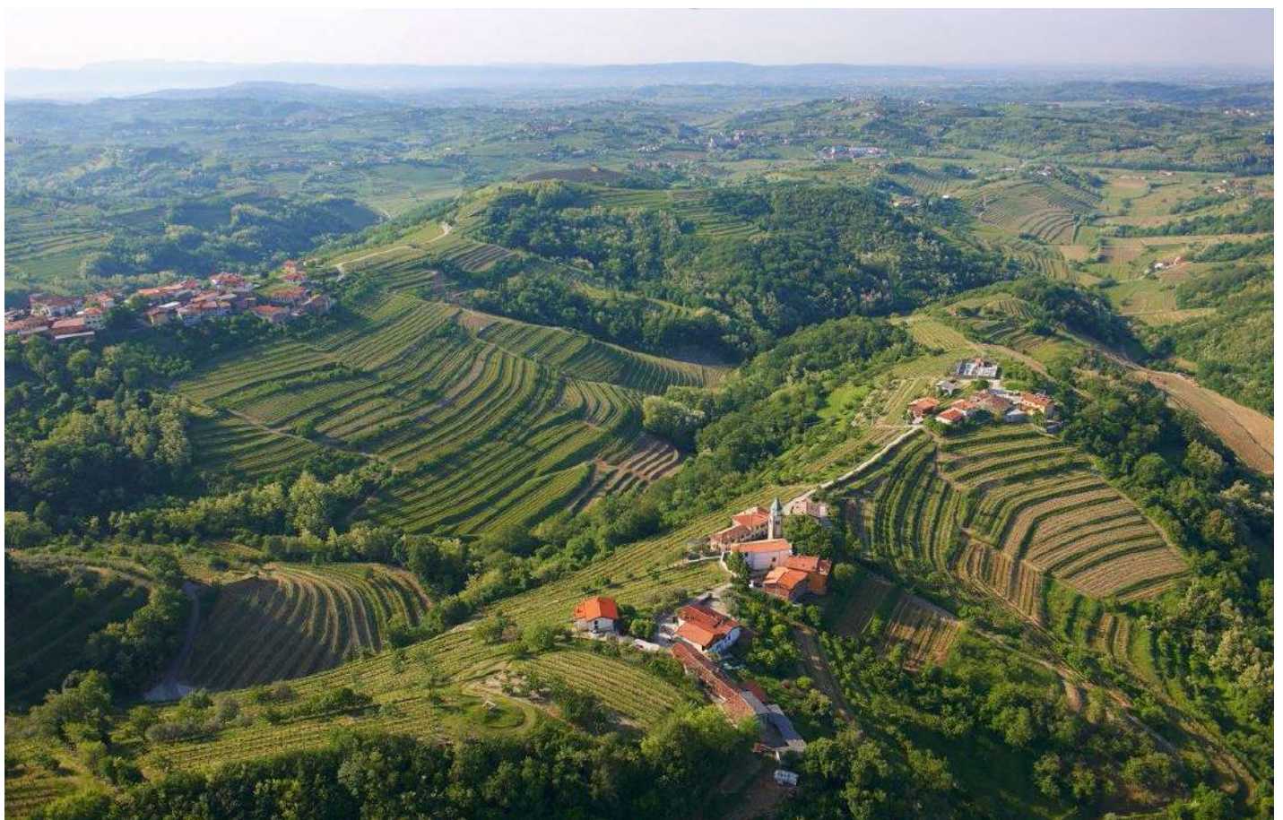
Goriška Brda / Collio – Slovenian Tuscany