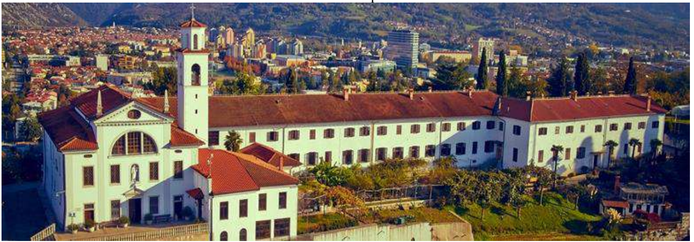
Kostanjevica Monastery, Nova Gorica