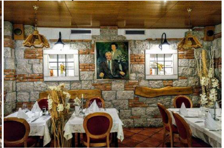
Hotel Grahor, Restaurant, Sežana