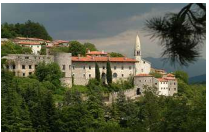
Štanjel The Hart of Carst and Terra Rossa