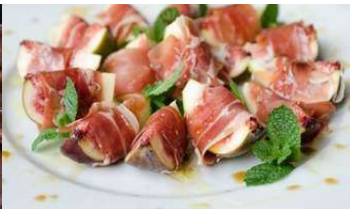
The Land of Prosciutto and Terra Rossa – The Carst Region