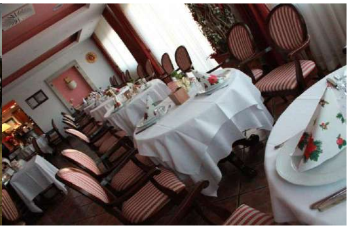
Hotel Grahor, Sežana