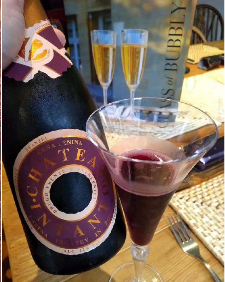
World No.1 Sparkling Red Wine Chateau Intanto. ( Top 5 and Trophy – Forget me Not,London 2018, Champion New York 2019)