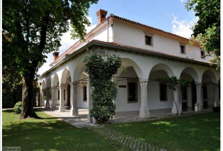
Castel of Zemono, Michelin star Restaurant, Vipava Valley