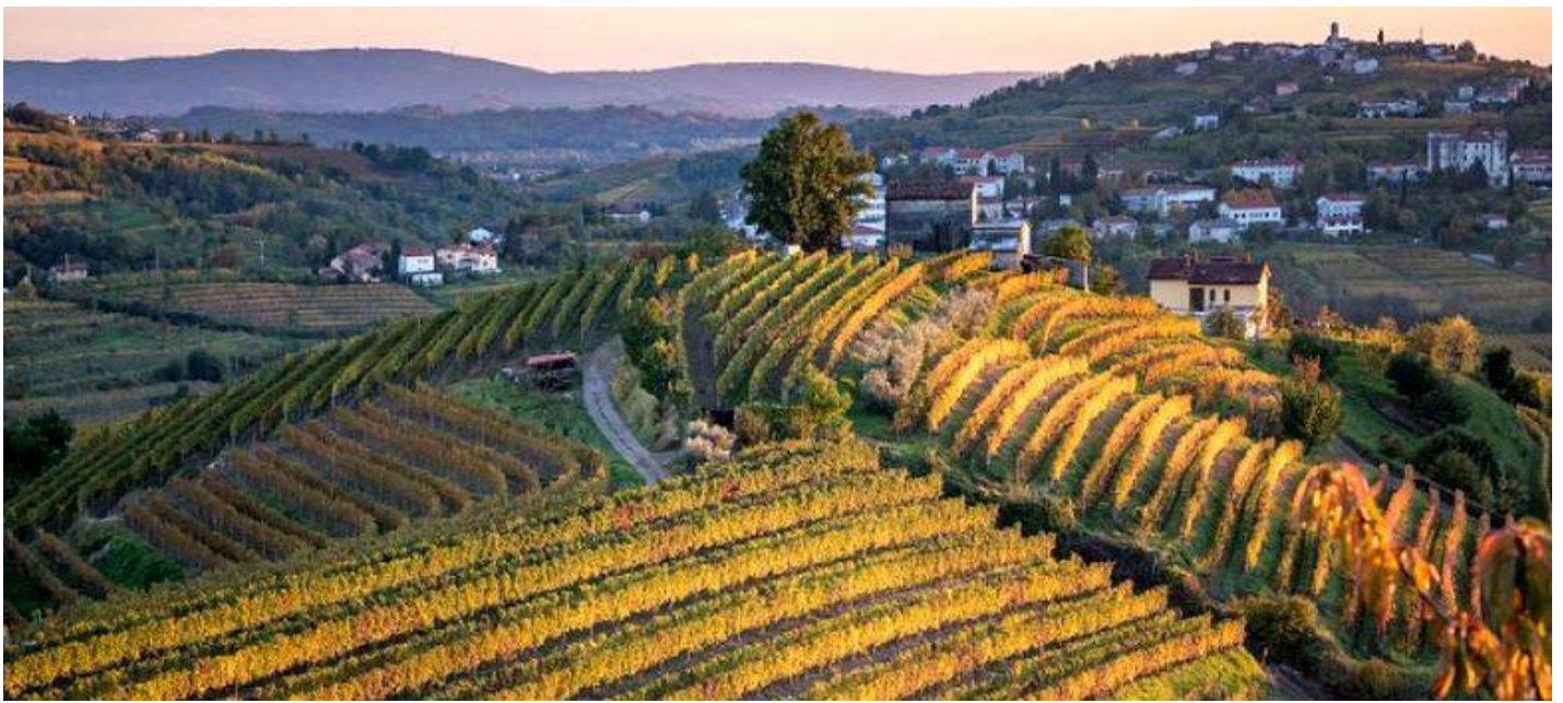
Goriška Brda / Collio – Slovenian Tuscany