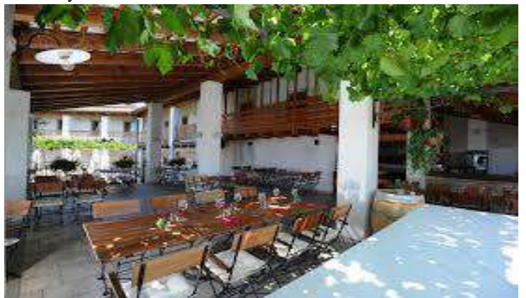
Best accommodation – in Goriška Brda - Belica Hotel / Restaurant