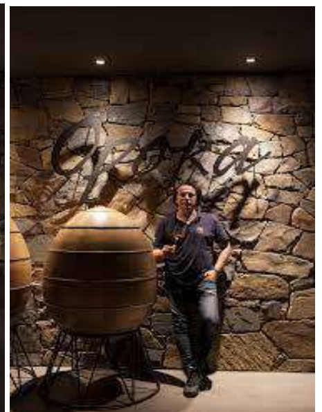
Marijan Simčič Winery